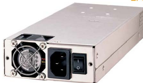
Dimensions: 100(W) x 40(H) x 250(D) mm