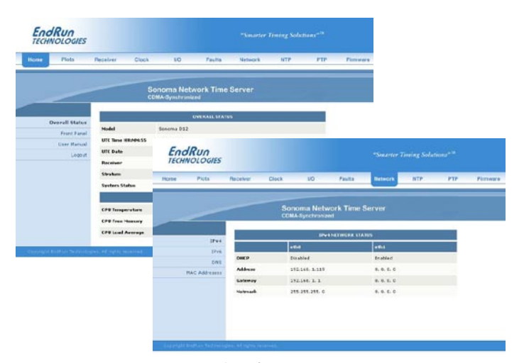
Web Interface (HTTPS) for Status Monitoring & Firmware Upgrades