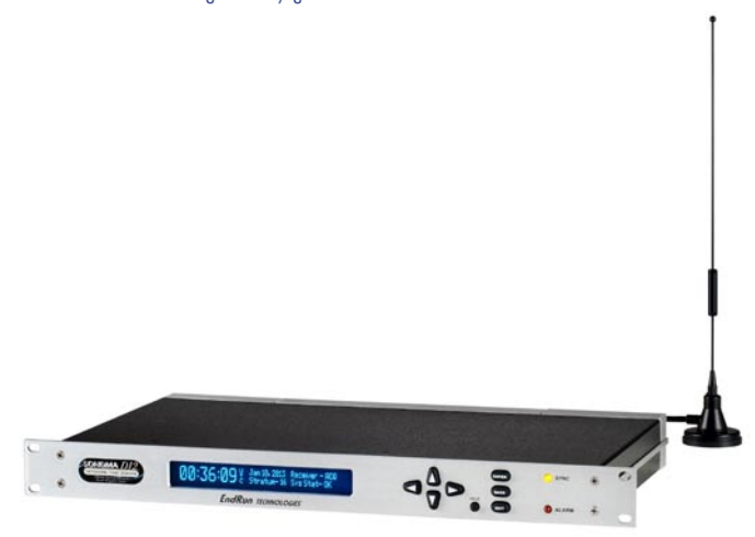
CDMA antenna with 12 feet of cable easily installs on top of your equipment rack.

www.endruntechnologies.com/guarantee.htm