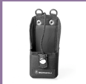
Nylon Carry Case HLN9701