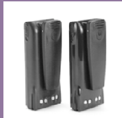
NiMH Battery & Belt Clip