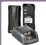
impres™ Smart Energy System