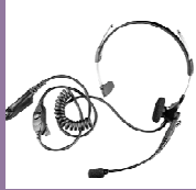
Light Weight Head Set AZRMN4018

A comprehensive range of accessories is available so that the radios can be customised to suit your needs. Adding the proper headsets, microphones, batteries, chargers or carry cases can enhance the productivity of the people who use two-way radios. Motorola accessories are built with the highest quality standards and are specially engineered to assure maximum performance of your radio, no matter what profession you're in.