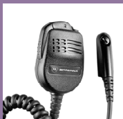
Remote Speaker Microphone PMMN4002